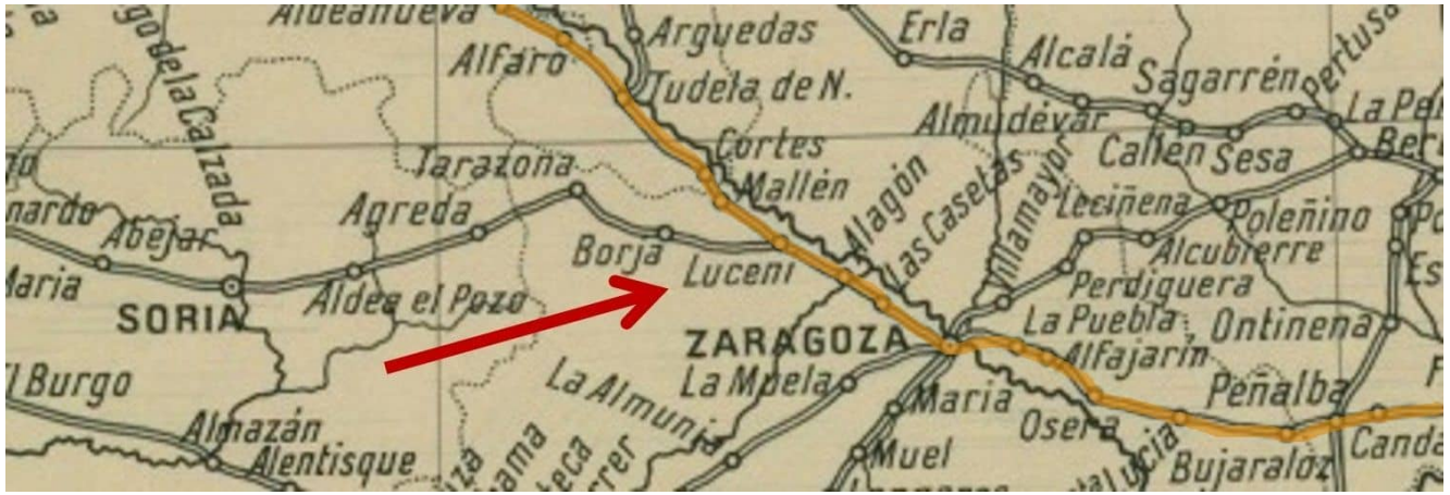
Luceni village in the 16th century